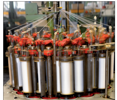
Taken at Voka's production site, these two images show textile sheaths being applied to electrical cables.